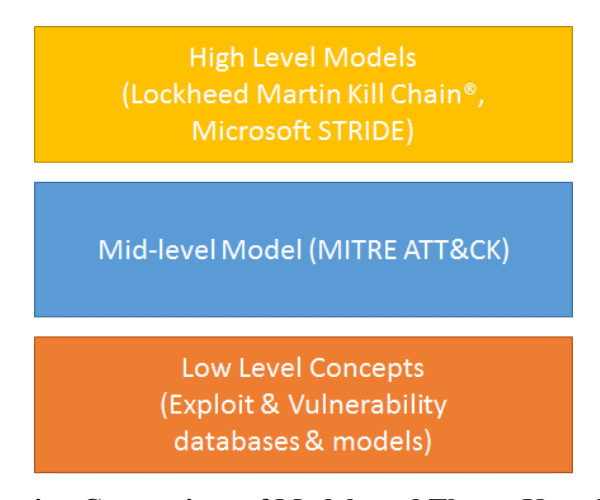
Figure 5. Abstraction Comparison of Models and Threat Knowledge Databases

A mid-level adversary model like ATT&CK is necessary to tie these various components together. The tactics and techniques in ATT&CK define adversarial behaviors within a lifecycle to a degree where they can be more effectively mapped to defenses. The high-level concepts like Control, Execute, and Maintain are further broken down into more descriptive categories where individual actions on a system can be defined and categorized. A mid-level model is also useful to put lower level concepts into context. Behavior-based techniques are the focus as opposed to exploits and malware because they are numerous but are difficult to reason about them with a holistic defensive program other than regular vulnerability scans, rapid patching, and IOCs. Exploits and malicious software are useful to an adversary toolkit, but to fully understand their utility, it's necessary to understand the context in which they can be used to achieve a goal. The mid-level model is also a useful construct to tie in threat intelligence and incident data to show who is doing what as well as the prevalence of use for particular techniques. Figure 4 shows a comparison of the level of abstraction between high, mid, and low level models and threat knowledge databases: