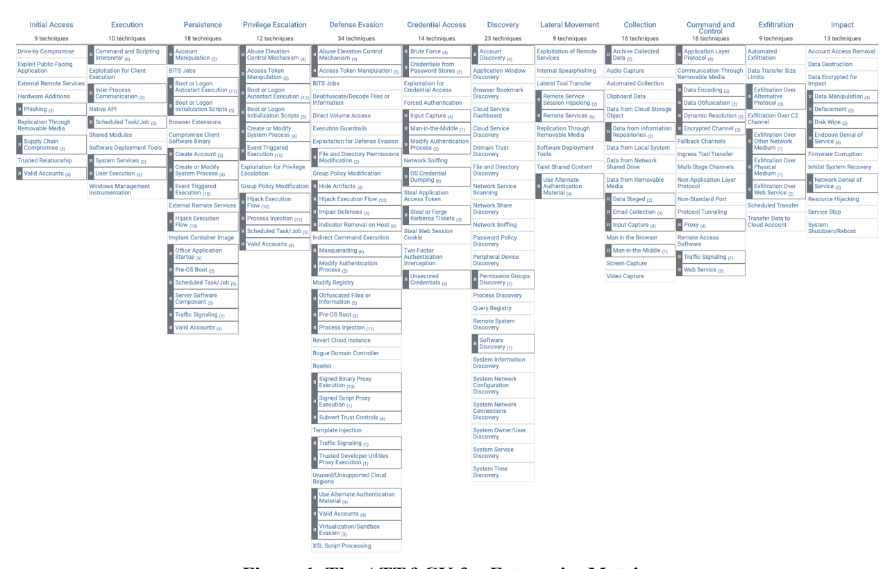
Figure 1. The ATT&CK for Enterprise Matrix

The relationship between tactics, techniques, and sub-techniques can be visualized in the ATT&CK Matrix. For example, under the Persistence tactic (this is the adversary's goal – to persist in the target environment), there are a series of techniques including Hijack Execution Flow, Pre-OS Boot, and Scheduled Task/Job. Each of these is a single technique that adversaries may use to achieve the goal of persistence. Figure 1 depicts the ATT&CK Matrix for Enterprise